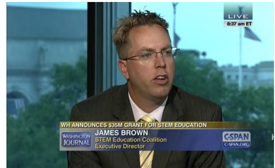
We Advocate on the National Stage