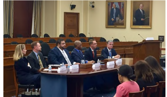
We Understand the Issues