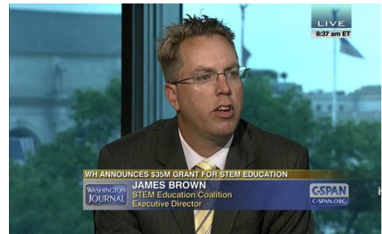
We Advocate on the National Stage