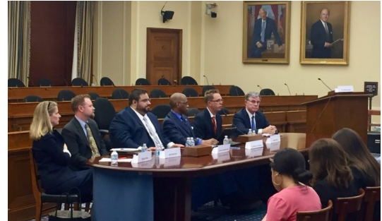
We Understand the Issues